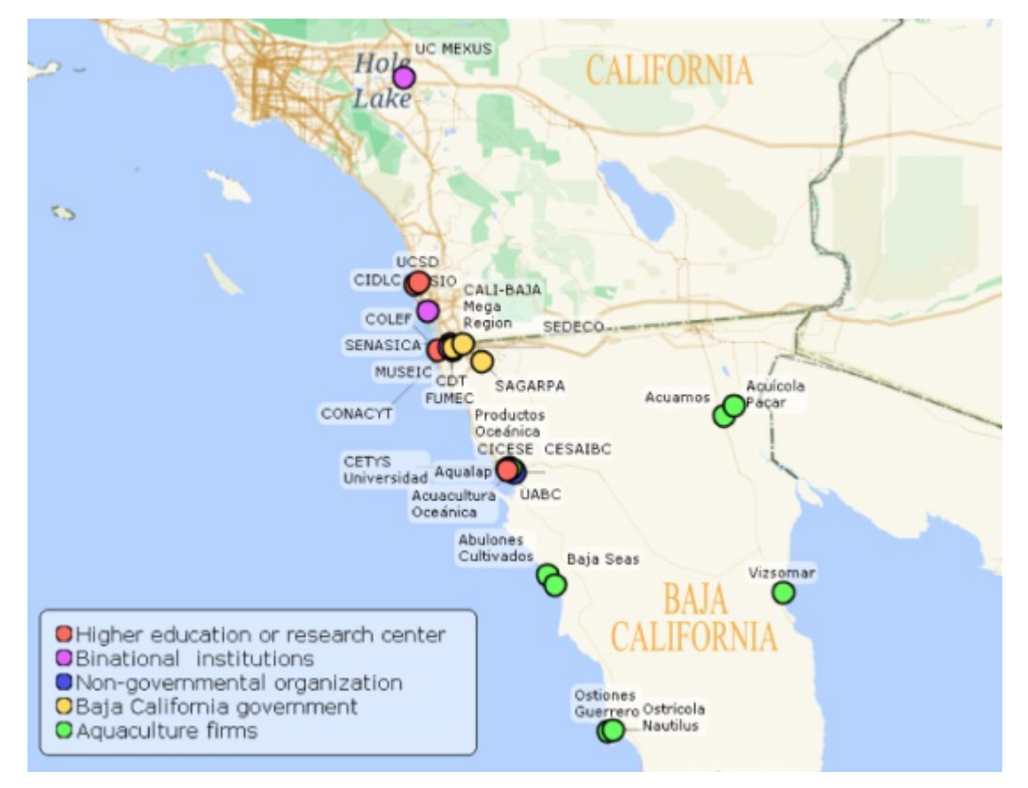
Map 1. CaliBaja - binational innovation ecosystem stakeholders

Assuming that to identify significant local contributors, innovation ecosystem research should focus on studying key factors and success elements for their effective management (Viitanen, 2016), we use social network analysis methodology to focus not only on the actors themselves, but especially on the connectivity and relationships among them. By studying the network and its interactions, we can understand its multiple relationships as well as identify key nodes or local significant contributors. The purpose of this study is to identify significant local contributors among CaliBaja's binational innovation ecosystem. First, we map ecosystem actors by studying their historical processes of emergence and growth. The ecosystem's network in our study is composed of 27 actors with different