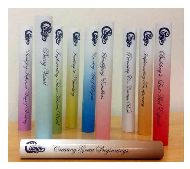
Figure 1. Toolbox batons, each representing one of the 10 themes

All ten themes were discussed, tested, and further developed during the Change2020 programme. The themes were concretized into 10 wooden batons (Figure 1), which were used during co-creation activities, including the bench-learning workshops. Also, a Toolbox game-development competition was arranged. There were several ways discovered with respect to how the Toolbox batons could be used as physical objects for generating ideas in day-to-day work or in weekly or monthly meetings to improve the working practices and change the working culture towards more innovative and productive directions. For example, the "Being Visual" baton was used for discussing which practices were used when presenting information or publishing results in projects and, if the current practices were not satisfactory in visual terms, how they could be improved. The Toolbox game can be found at: http://www.innofokus.fi